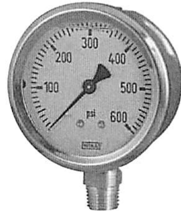
Bourdon Tube Pressure Gauge Model 21X.53